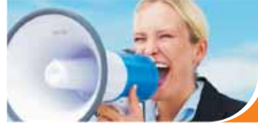
what people say about us