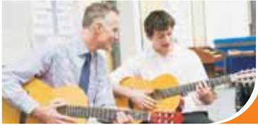
after school activity