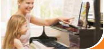
individual music lessons