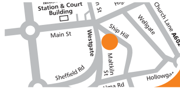
where to find us